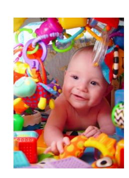
What does a child know about Birthdays?

Some time ago, a couple had arranged a party for the 1st birthday of their baby. In my calculation, I guess they would have spent nearly two lakh for the whole celebration. I reflected on what the celebration meant; for whose joy it is celebrated after all, as the baby was absolutely oblivious about the event. I concluded that the external celebration in the name of the baby was actually for the joy and satisfaction of the parents and friends. Here the baby sees, but cannot take cognisance of what is happening outside the baby's limited world.