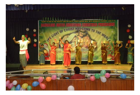
The Methodist Baldwin Boys' School staff performing an excellent piece of fisher women dance at the BUCF's Christmas event