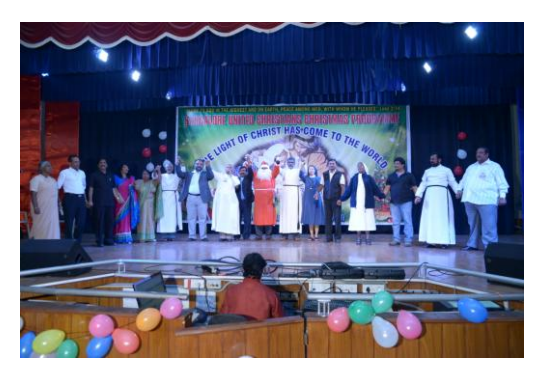
BUCF stands united singing unity anthem